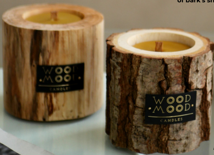
Ubud Compact Candle Rocky Compact Candle

Volcano candles are masterpieces made of burnt wood with bark, covered with beeswax using our authentic method for saving matte surfaces and preserving the beauty of bark's shape.