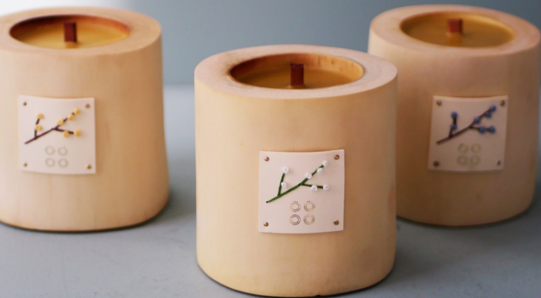
Blossom Compact Linden

Blossom line candles are made in two sizes: Compact and Original, both can be refilled with spare inserts, available with various essential oils.