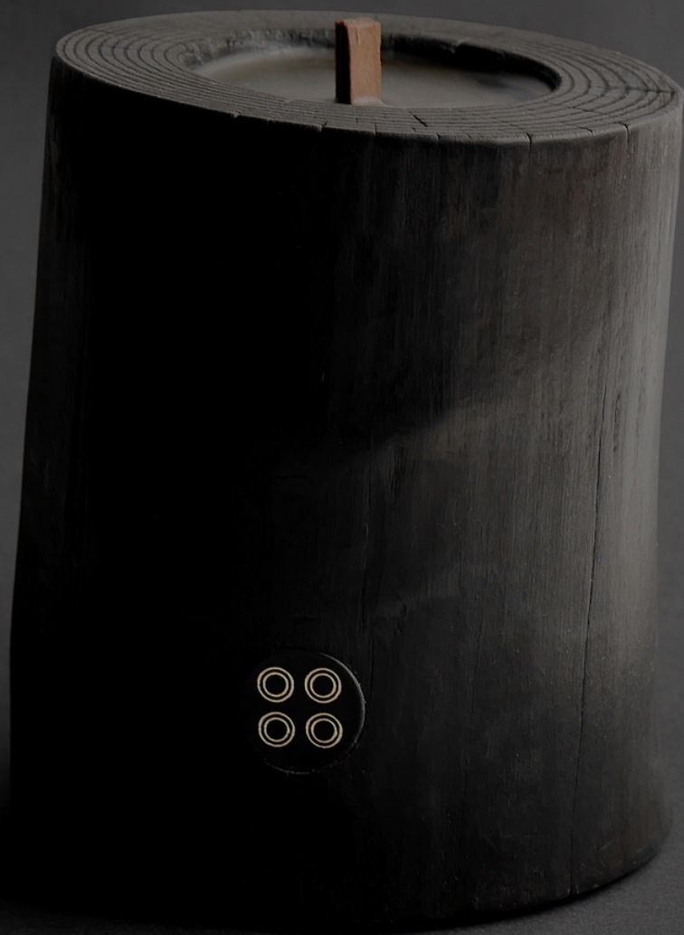
Black Illusions candle