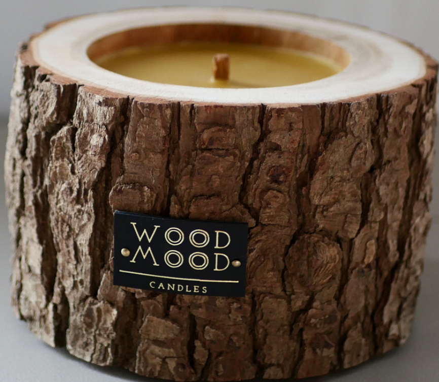
Rocky Patio Candle

Perfect for year-round enjoyment, whether illuminating summer evenings on the garden patio or creating cherished moments around the Christmas table.